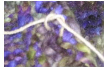
Knotting inside the sweater