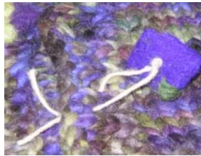
Pulling through the sweater