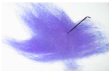
Begin needle felting

Begin to needle felt your button, by plunging your felting needle into the fibers on your Decadent Foam . The barbs on the needle will grab the fibers, entangling and entwining them. Continue jabbing up and down, in a quick, fast motion. The point of the needle only needs to pierce through the fiber and barely into the foam as you felt. Once your button shape holds together, flip it over and needle felt the backside. Remember where you plunge the point of the needle is where the fibers felt. Bring the fibers over the edge of your button, angle your needle and felt down the edge fibers toward the middle of your button to accomplish a sharp and refined edge. You can add more fiber and color to build up the size of your button. Keep needle felting until your button is dense and firm. At this point you can decorate your button using different colors from your bag of Penny Candy or use yarn from your project. We needle felted different colored stripes of our Crème Puff yarn on each button to compliment our knitted jacket.