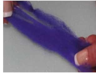
Pulling wisps of fiber