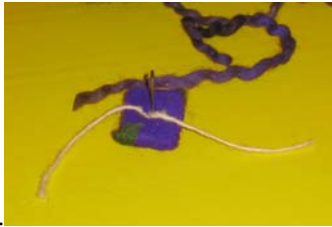
Adding yarn to back of button

Securely needle felt the center of a 5" piece of yarn to the center of the back of the button, making sure it is sturdy. To secure the button to the sweater, take the 2 ends of the yarn and poke them through to the inside of the sweater and tie in a knot. You may want to needle felt large buttons into the knitted surface of the garment to secure.