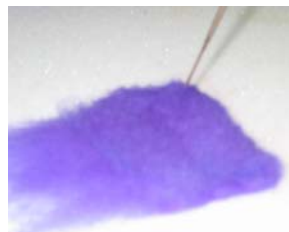
Shaping the button